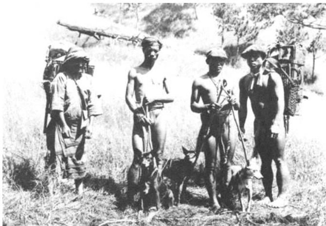
From the Worcester Collection